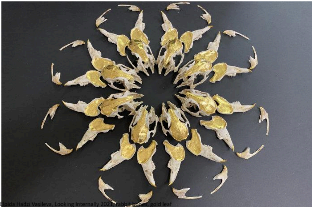
Elipida Hadzi Vasileva, Looking Internally 2021, rabbit bones, gold leaf

Women in Art Fair | 9-12 October 2024 Mall Galleries, The Mall, London SW1 womeninartfair.com | @womeninartfair