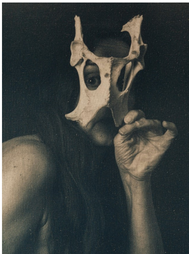
Elissa Jane Diver, Deer Stalking (detail), 2022. Cyanotype on linen, toned with oak tannins.

Seminal names in women's art are to be shown alongside emerging talent at Mall Galleries' East Gallery in a show exploring bodily nature and landscape.