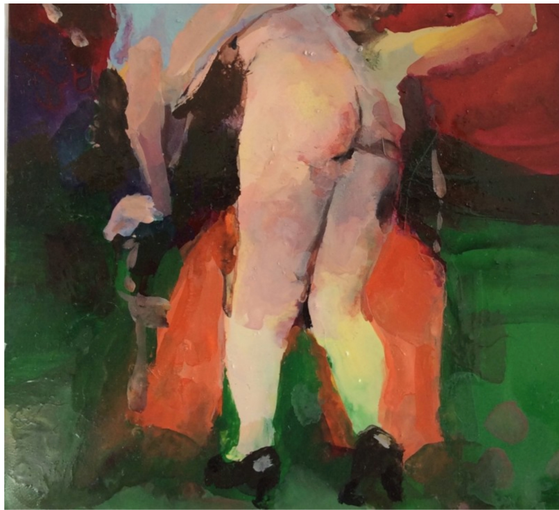
Geraldine Swayne, Circus Spankers , 2016. Enamel on Aluminium, 13 x 10cm.