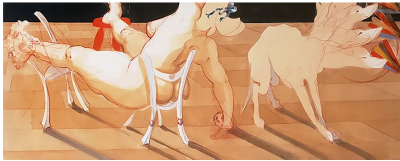
Book Club by Zoe Spowage, on show with Blackbird Rook Gallery.